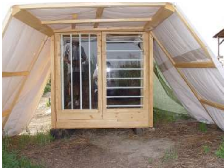
flight tunnel 2004

“%“ birds flying towards the marked pane in the choice experiment