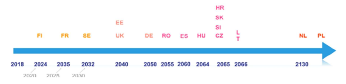
Figure 2: Planned start of operation of deep geological repositories in EU member states (EC Report 2019, p. 9)

In the EC Report 2019, the timeline for the planned operation start of national DGRs was presented.